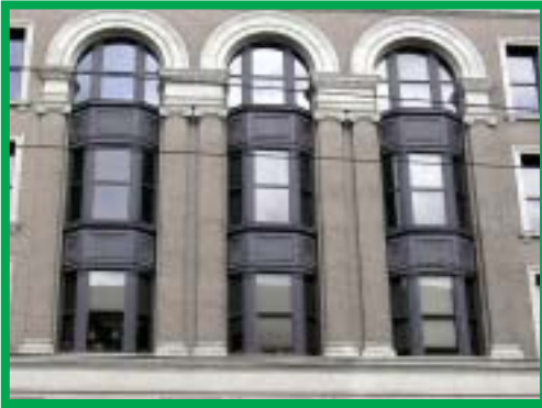
Details of Arched Windows

Originally built in 1904, this six story office building is one of the largest neoclassical buildings remaining in Houston. The structure was renovated in 2000 using TIRZ assistance. The scope of work consisted of exterior demolition, facade rehabilitation/renovation, basement vault topping, and streetscape enhancement within the public right-of-way.