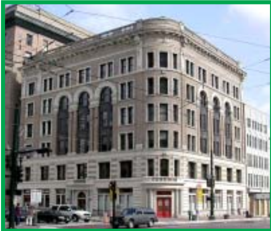
View of Completed Project